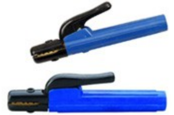
Welding Electrode Holder