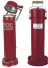
Electrode Drying Oven