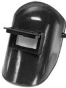
Shell Welding Helmet